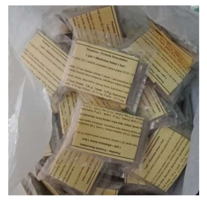
Figure 1. The local food-based formula product in the form of powder

Local food-based formulas are given in the form of powder and the subjects can turn it into thick liquid food by adding 125 cc of hot water at 90-96°C. The product image is shown in figure 1. Consumers are increasingly interested in functional foods (19).