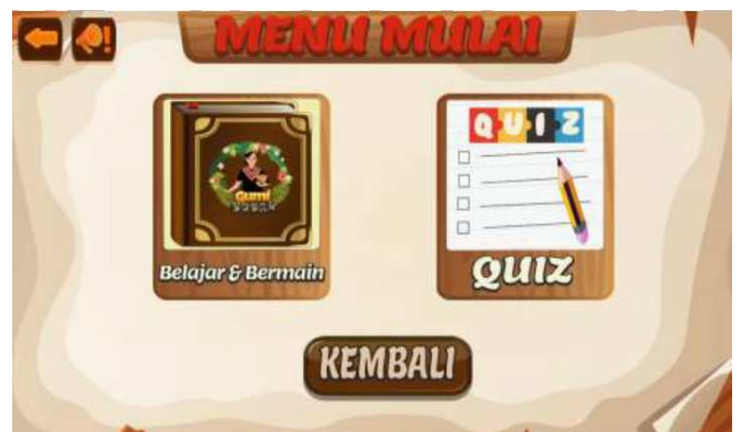
Fig. 3. Learning and play page