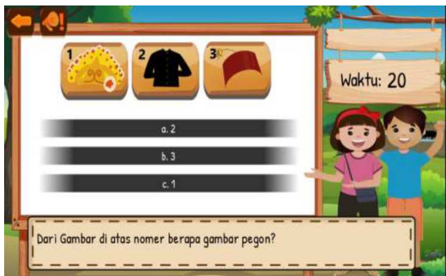
Fig. 7. Level 2 quiz game page

The aspect of assessment by media experts shows very good for media delivery strategies in accordance with student characteristics that can encourage students to think critically in problem solving and can increase contextuality with applications according to everyday life. Application functionality testing from black box testing shows the results of Visual Novel Game learning media are appropriate. The last test on the black box using the User Acceptance Test (UAT) has user satisfaction of Visual Novel Game learning media with very good results. The application feasibility results show very good with a percentage of 87.76% and the usability of the application shows very good with a