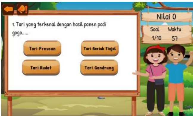
Fig. 6. Level 1 quiz game page