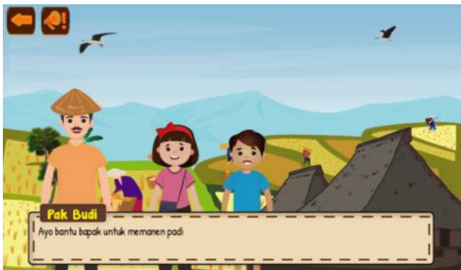
Fig. 5. Time Portal page

errors, the latest and up-to-date material, the coverage and depth of the material, the adequacy of the reference and the interest and motivation of students. The results show that there is a novelty and depth of material that increases student motivation which is very good in learning.