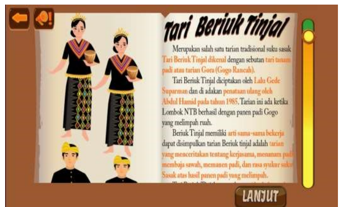
Fig. 4. Material page

The results of testing the feasibility of Visual Novel Game learning media using Whitebox and Blackbox methods. Testing was carried out by media experts, material experts of elementary school students. Based on the assessment aspects by material experts, all components contained in the Visual Novel Game learning media have fulfilled in terms of assessment aspects which include the correctness of the material content, free from conceptual