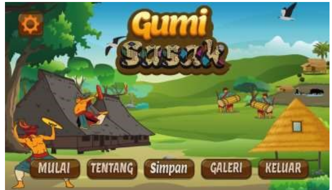
Fig. 2. Home page

The result of the research is a visual novel educational game on typical Lombok dances. The main page in Fig. 2 of the visual novel educational game media contains the title, start button, about button, save button, gallery button, and exit button. The start menu page contains the learn button and the play button can be seen in Fig. 3. The material about the typical traditional dance of the Sasak Lombok tribe can be seen in Fig. 3, Fig. 4, and Fig. 5. Fig. 6 contains the quiz at level 1 and Fig. 7 contains the level 2 quiz.